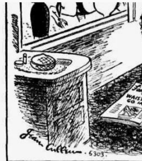
"Just sing out when